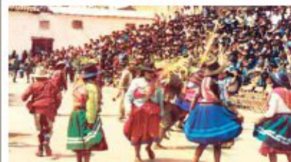
Celebrations in honor of the Divine Child