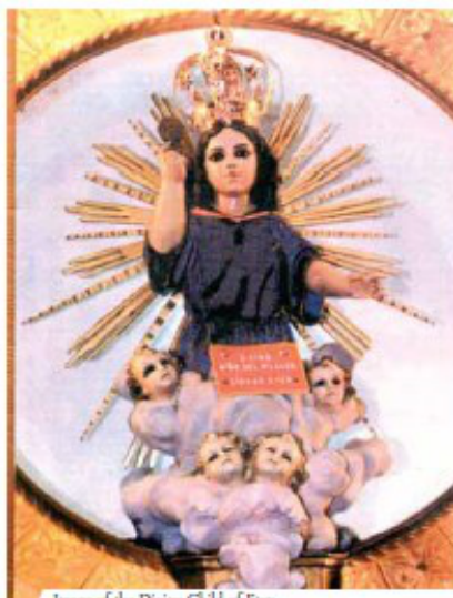
Image of the Divine Child of Eten

The Eucharistic Miracle of Eten happened about 365 years ago in the Peruvian town of Port Eten. In a Host exposed for public adoration, there appeared the Child Jesus and three interconnected hearts of a brilliant white color. Every year, the feast in honor of this event begins on July 12, with the transfer of the Host of the Miracle from its Sanctuary to the church in the City of Eten, and it ends on July 24.