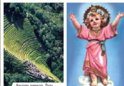
Ancient terraces, Peru