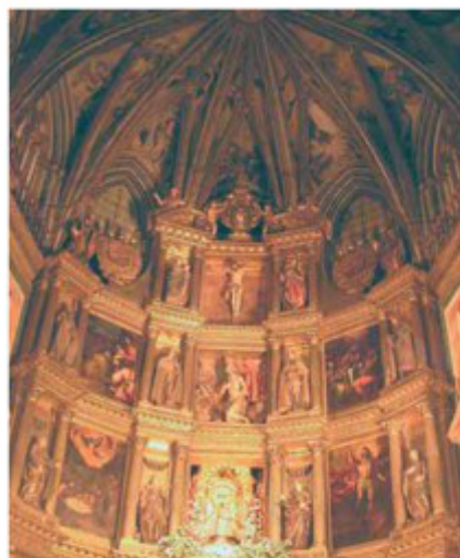
Retable of the Madonna of Guadalupe