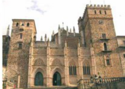
Church of Nuestra Señora of Guadalupe

Even today, in the sanctuary of Guadalupe, it is possible to admire the precious relics of the Corporal and of the bloodied pall (the pall is the small rigid linen cloth, of square shape, that serves to cover the chalice and the patent), used during the miraculous Mass from the Venerable Don Pedro Cabañuelas, in the region of Toledo. He was always distinguished for his deep devotion to the Holy Eucharist, and he spent many hours in adoration both night and day before the Blessed Sacrament. He had been brutally tempted to doubt about the reality of transubstantiation, but in 1420 all of his doubts had disappeared. As he had been accustomed to do daily, Don Pedro began to celebrate the Holy Mass: at the moment of the consecration he saw a dense cloud to come down from above and settle itself above the altar. He could not see anymore.