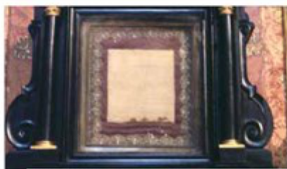
Relic of the Blood-stained corporal