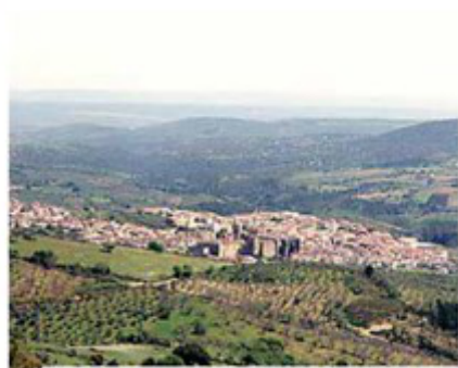
View of Guadalupe