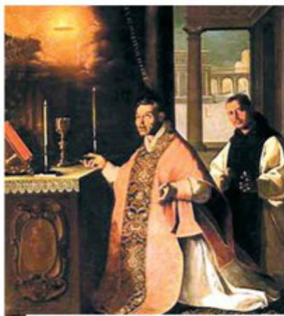
Francisco de Zurbarán, re-creation of the miracle

During the celebration of the Mass, a priest saw numerous drops of Blood fall from the consecrated Host. The miracle contributed to strengthening the belief of the priest and many of the faithful, among whom was also the King of Castile. There are numerous documents that testify to the miracle. The relics of the marvel had been exhibited to the veneration of the faithful during the Eucharistic Congress of Toledo in 1926 and even today are the objects of deep devotion to the whole of the Spanish people.