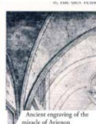
Ancient engraving of the miracle of Avignon