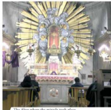
The Altar where the miracle took place