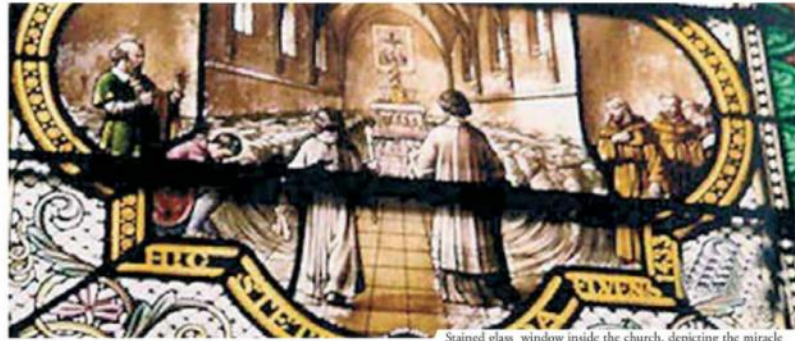
Stained glass window inside the church, depicting the miracle

On November 30, 1433 a small church run by the Gray Penitents of the Franciscan Order was exposing a consecrated Host for Perpetual Adoration. After days of rain the rivers swelled, and surprisingly, Avignon was submerged. By boat, two friars of the Order succeeded in reaching the church where the Holy Sacrament had been left for adoration. When they entered the church, they saw that the waters were divided to the right and to the left, leaving the altar and the Sacrament perfectly dry.