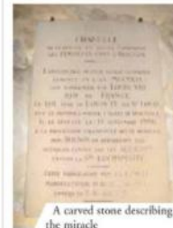
A carved stone describing the miracle