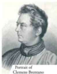
Portrait of Clemens Brentano