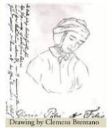
Drawing by Clemens Brentano

A nne Catherine Emmerich was born in Germany on September 8, 1774 into a family of farmers and began to work very early. Later on, a religious vocation matured and she asked to be admitted in several monasteries, but she was always rejected because she was very poor and had no dowry. Only when she was twenty-eight years old she was accepted in the monastery of Agnetenberg, where she joined the monastic life with fervor, always ready to take the most difficult tasks. One night while she was praying, Jesus appeared and offered her a crown of roses and a crown of thorns. She chose the crown of thorns and Jesus put the crown on her head. Suddenly, around her forehead appeared the first stigmata. Later on, after another apparition of Jesus, the wounds also appeared in the hands, feet and side. In 1811, the monastery of Agnetenberg,