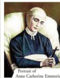
Portrait of Anne Catherine Emmerich