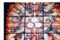
The stained glass window in which the three miraculous Hosts are depicted