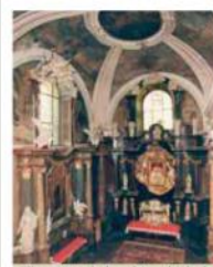
The original chapel in which the miraculous Hosts were preserved up until the last century