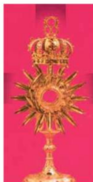
At the Eucharistic Shrine, the precious monstrances donated by the King (Wladyslaw) Jagiello are preserved and are still used for the exposition of the Blessed Sacrament