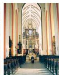
The interior of the shrine