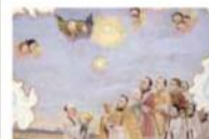
A fresco located on the ceiling of the Sacristy of the Eucharistic Shrine, in which a scene of the miracle is represented