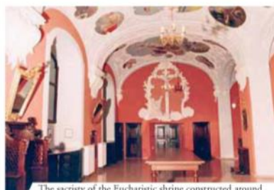
The sacristy of the Eucharistic shrine constructed around the middle of the 18th century