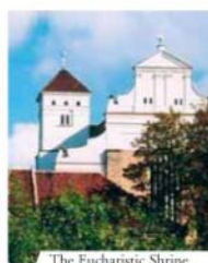
The Eucharistic Shrine

In the city of Poznan, in 1399, three consecrated Hosts were robbed by some desecrators who struck them with some hole-punchers in order to deface it. The Hosts began to drip blood and every attempt to destroy them proved futile. At that point, the malefactors, in order not to be discovered, decided to cast them into a marsh. But the particles were suspended in the air and began to radiate strong flashes of light. Only after fervent prayers did the bishop succeed in recovering the particles, which can be venerated today at the Church of Corpus Christi in Poznan.