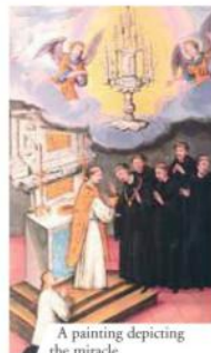
A painting depicting the miracle