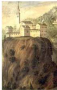
The ancient monastery of St. Georgenberg developed in two complexes, one on the mountain and the other in the valley