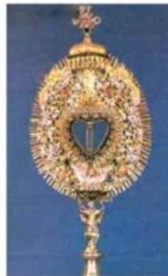
Silver and gold monstrance from 1719 in which the precious blood of the miracle is preserved

The little village of St. Georgenberg-Fiecht, in the Inn Valley, is very well known, especially for a Eucharistic miracle that took place there in 1310. During the Mass, the priest was seized with temptations regarding the Real Presence of Jesus in the consecrated elements. Right after the consecration, the wine changed into blood and began to boil and overflow the chalice. In 1480, after 170 years, the sacred blood was “still fresh as if it had come out of a wound,” wrote the chronicler of those days. It is preserved intact to this day and is contained in the reliquary in the Monastery of St. Georgenberg.