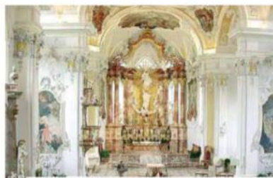
Interior of the church