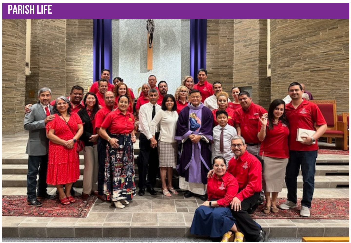
¿Qué es el día mundial del matrimonio?