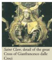
Saint Clare, detail of the great Cross of Gianfrancesco dalle Croci