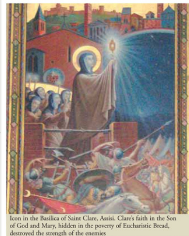
Icon in the Basilica of Saint Clare, Assisi. Clare's faith in the Son of God and Mary, hidden in the poverty of Eucharistic Bread, destroyed the strength of the enemies

T his Eucharistic Miracle is cited in "The History of Saint Clare, Virgin," written by Tommaso da Celano, and describes how Saint Clare of Assisi succeeded with the Blessed Sacrament in turning away Saracen troops in the pay of Emperor Frederick II of Sweden.