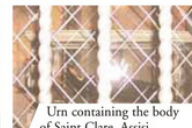
Urn containing the body of Saint Clare, Assisi