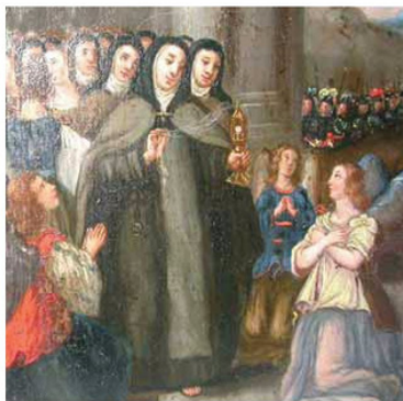
Ancient depiction of the Miracle of Saint Clare