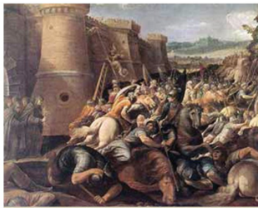
Saint Clare and the Assault on Assisi, Giuseppe Cesari (1568-1640). Hermitage Museum, St. Petersburg

The History of Saint Clare, Virgin, tells of various miracles performed by Saint Clare. There are episodes of multiplications of loaves, of bottles of oil that appeared in the convent when there was none before. But Clare performed the most famous of the miracles in 1240, on a Friday in September, in which she turned away an attack by Saracen soldiers who had broken into the convent cloister by showing them the Sacred Host.