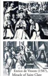
Enrico de Vroom (1587), Miracle of Saint Clare