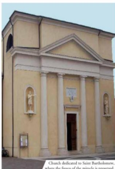
Church dedicated to Saint Bartholomew, where the fresco of the miracle is preserved.

An extraordinary event occurred in Salzano in 1517. A priest was called with urgent haste to bring the Viaticum to an invalid on the brink of death. The season and the time of day were not appropriate to make a procession, and so the priest had to be content with only one altar boy. Upon arrival at the meadows surrounding the Muson River, several donkeys that were grazing faced themselves in the direction of the pious convoy and, after approaching the priest, they bowed on their knees and then followed the Most Holy Sacrament all the way to the home of the infirm, renewing the genuflection; and then, always with the priest, they walked back to return to the pasture.