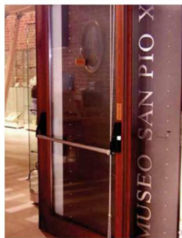
Museum of St. Pius X in Salzano, where relics, documents, mementos and precious objects are preserved, among which are the very beautiful chaubles and stoles donated by the same Pope.