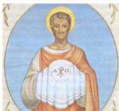
Saint Satyrus and the Eucharist